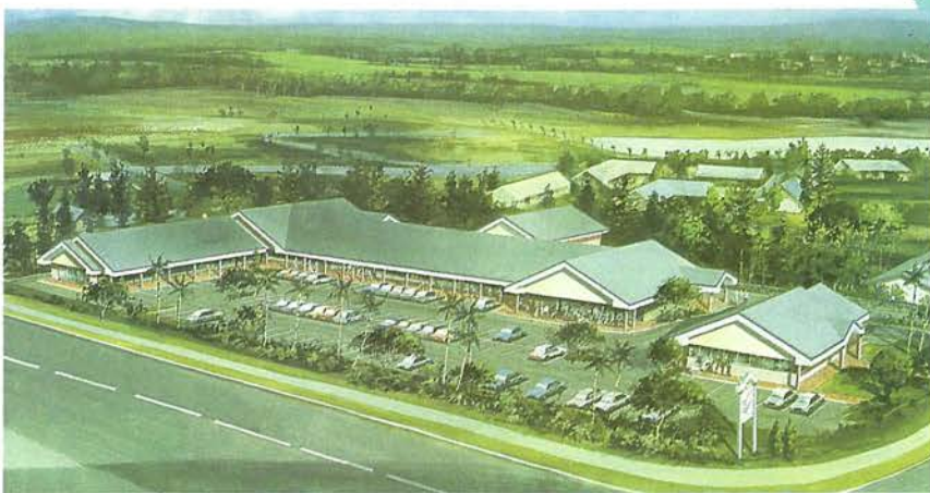
Artists impression of the Logandale Shopping Centre and Child Minding Facilities, adjacent to the main entrance.

Logandale is approximately 220 acres of well-planned, fully secured estate and borders onto one of the prettiest reaches of the Logan River. The perfect setting for families to relax, walk the dog, or enjoy a spot of fishing and crabbing.